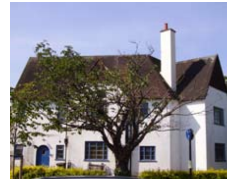
7 Victoria Park Road: this fine 1930s house is currently being restored