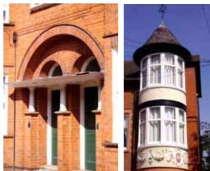
Above left: porch detail to 33/35 Springfield Road and right: decorative plasterwork to turreted bay at number 27

best materials, sourced locally (such as the Swithland slates on the roof and whitewashed bricks), and is built to express the simple honest tradition of English vernacular architecture. Note particularly how its simple design contrasts with the more ornate and somewhat self-important houses we’ve seen elsewhere. Interesting features include the windowless splayed end wall and the moulded plasterwork on the bay windows with the date and initials of the original owner – ‘A.J.G’. If you are interested in seeing another Gimson house you can follow Tour No. 2 to Ratcliffe Road and see ‘ Inglewood ’ (point K on the map).