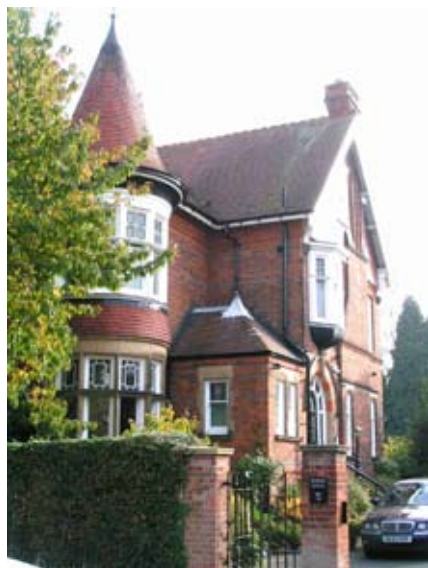
The Bishop's Lodge 10 Springfield Road

9 At the end of Central Avenue you will see The White House, North Avenue , behind its attractive scalloped boundary wall. A nationally important listed building, it was designed and built by Ernest Gimson in 1897 for his brother, and represents the Domestic Revival movement of the William Morris school – part of the Arts and Crafts movement. It takes a traditional approach to building – using the