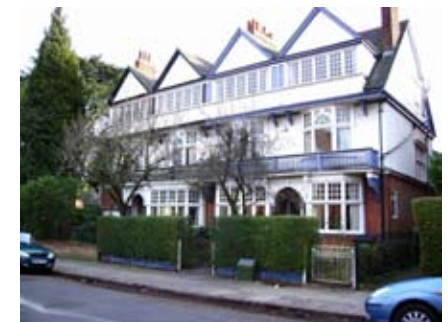
Numbers 4-6 Springfield Road in the Arts and Crafts style

4 4-6 Springfield is a pair of Grade II listed 1900 Goddard semi-detached villas in the Norman Shaw manner. Based on the Queen Anne style these have roughcast walls and Ipswich windows at first floor level. The pierced balustrade at first floor level and the long horizontal projecting second floor windows (known as a 'jetty') are a delight.