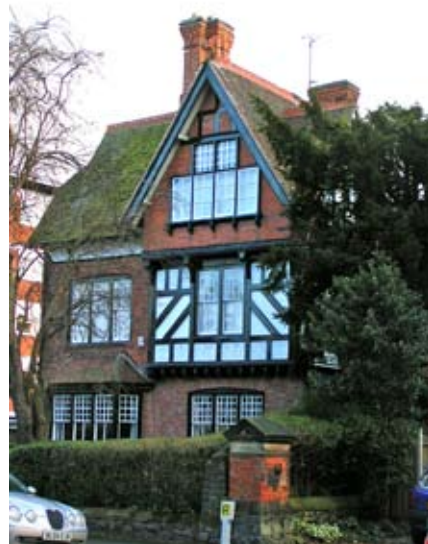
12 Knighton Park Road.