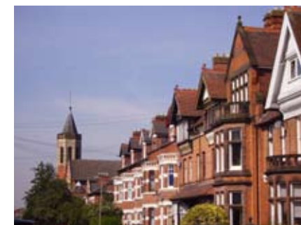
The spire of Christchurch near the corner of Clarendon Park Road/Central Avenue