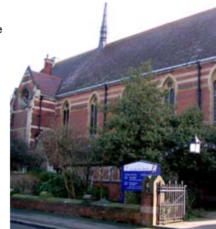
St. John the Baptist Church, Clarendon Park Road.

23 Continuing along London Road note the houses on the corner of St John's Road - 290-292 London Road . This pair of semi-detached villas (dated in the pediments 1889) is in a sort of renaissance style and are by the Goddard and Paget Partnership. They have lots of rich detailing and retain their original small paned windows. The refurbishment of the left hand end included a meticulous repair and restoration of the original windows – an essential element of the building if it is to retain its character. Imagine what the building would look like if the windows had been taken out and replaced with modern plastic ones.