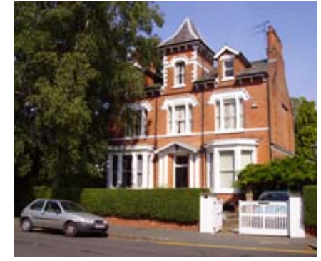
15 Knighton Park Road.

19 Further down is " Eastfield " which was used for many years as a student hall of residence but is now being re-used as a school with plans for houses in the grounds. It was built in 1844 and remodelled several times. A large house built in expensive white bricks, it has lovely fishscale roof tiles, elaborate chimney stacks and bargeboards and big mullioned windows