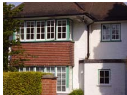
11 Knighton Park Road - a design by the Goddard partnership from 1910

16 Finally there is 12-14 – a big brick semi-detached villa probably designed by Stockdale Harrison. The painted stonework at number 12 is unfortunate but the big bold full height bays topped with conical roofs and decorative finials are great fun.