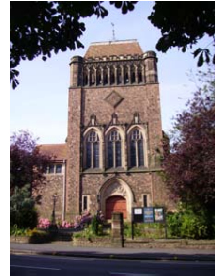
Clarendon Park Congregational Church, Springfield Road/London Road

1 Our tour starts at the Congregational Church , a very dramatic building in local Mountsorrel granite by James Tait and dating from 1885-6. This Grade II listed building has a striking tower and is an important local landmark. Tait, a Congregationalist himself, produced a building that closely resembles a Gothic Anglican church but is appropriately subdued. The big tower pretends to be a West tower but is actually on the east side and the 'belfry' has no bells!