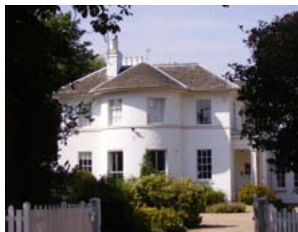
The Firs, London Road

22 Cross over London Road at the pedestrian crossing and turn left towards The Firs at 223 London Road . This building is one of the two Italianate houses to have survived in Stoneygate (we saw the other in Springfield Road at the beginning of the walk). This Classical style was very popular in the first 2 decades of the 19 th century – restrained detail, stucco etc. Its use as offices ensures its survival – lots more examples can be seen in New Walk, an easy stroll northwards across Victoria Park.