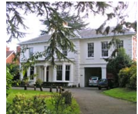
2 Springfield Road.

2 Go left then turn right into Springfield Road which was laid out in 1884 under the supervision of Isaac Barradale. Here there are buildings by several of the best local architects of the time as well as one of the earliest houses remaining in Stoneygate at number 2 – a stuccoed mid-19 th century Grade II listed house in the Classical style, Stoneygate House (virtually invisible behind trees and fencing and a curving drive).