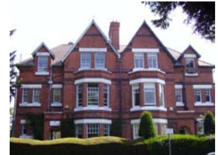
6 & 8 St. Mary's Road facing the delightful triangular public open space