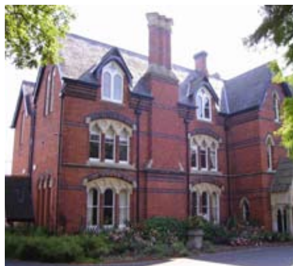
Scholars Walk, London Road

20 Walk back to London Road and turn left turn until you reach the driveway into Scholars Walk . This is the former Stoneygate School (hence the new name, Scholars Walk) which was purpose-built in 1859 by Henry Goddard in the Gothic style. The Gothic style is quite rare in Stoneygate. It was known locally as Rudd's School (presumably after one of the early owners/headmasters). Again, sympathetic restoration – the Council required that any new development retained the existing building – has created 4 luxury apartments, with well-planted grounds, creating a surprising haven on this busy road.