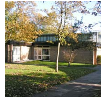
East Avenue: St. John the Baptist C of E Primary School.