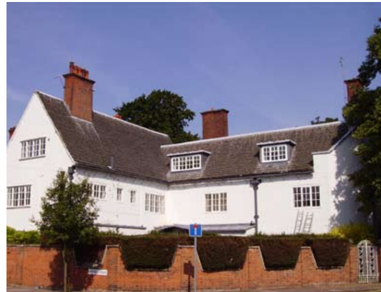
The White House, North Avenue

The whole walk should take you about 1-1½ hours. If you want to break for refreshments the city centre is only 5 minutes away by bus or you could visit Queens Road nearby where there is a selection of bars and restaurants. The houses you will be passing are people's homes, so please remember to respect their privacy.