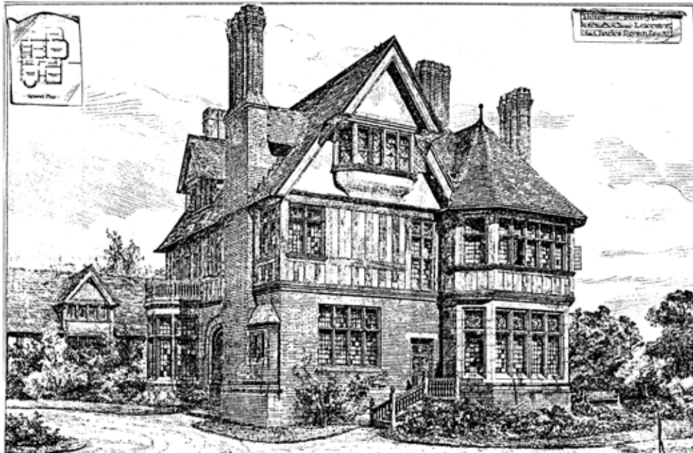
The original architect's line drawing of 10 St. Mary's Road, Stoneygate