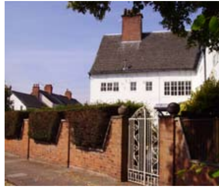
The White House, Central Avenue.

15 At 24-28 is a terrace of 3 houses by the Goddard Partnership, an almost symmetrical design with a large horizontal window tying the whole together at second floor level. Then there is number 20 , possibly the best of the row, by Samuel Perkins Pick, with a big jettied and gabled top floor and tall chimney stacks.