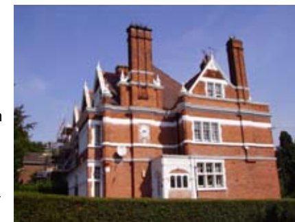
290-292 London Road

22 Cross over London Road at the pedestrian crossing and turn left towards The Firs at 223 London Road . This building is one of the two Italianate houses to have survived in Stoneygate (we saw the other in Springfield Road at the beginning of the walk). This Classical style was very popular in the first 2 decades of the 19 th century – restrained detail, stucco etc. Its use as offices ensures its survival – lots more examples can be seen in New Walk, an easy stroll northwards across Victoria Park.