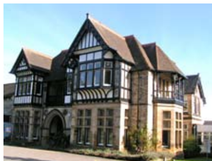
"Brookfield", London Road