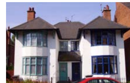
22-24 Central Avenue