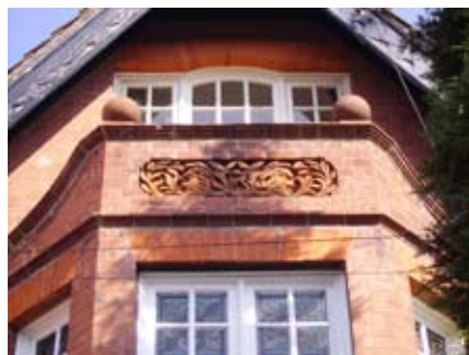
31 Springfield Road: moulded brick decoration