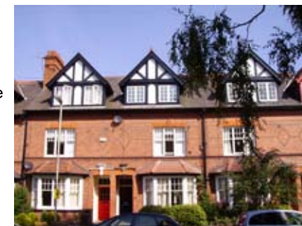
Part of the terrace at 43-55 Springfield Road